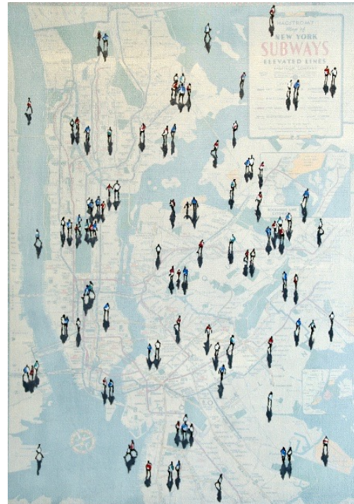
Eline de Jonge Shadows on vintage NY subway map Mixed media on canvas with frame H 28" x W 20" Unique $ 1,950