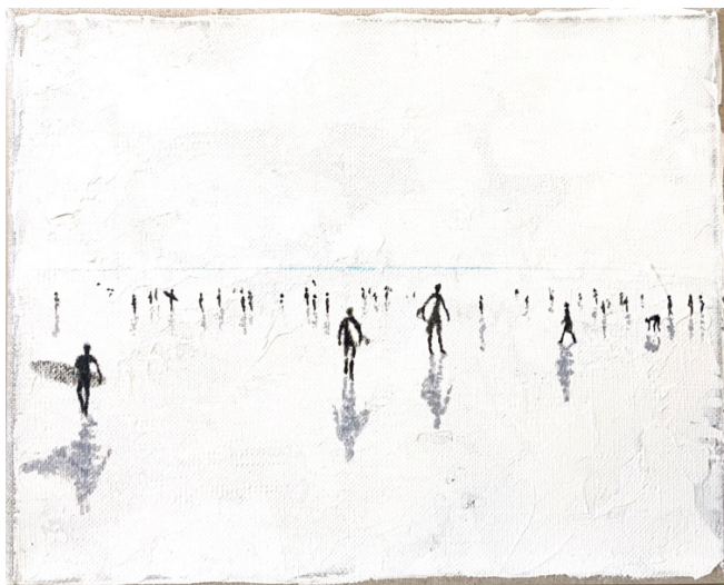
Eline de Jonge Shadows on Sand – Study I Oil on canvas - unique 10" x 12" $ 700