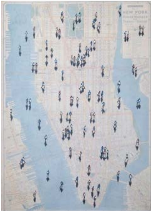
Eline de Jonge Shadows on vintage NYC street map Mixed media on canvas with frame H 28" x W 20" Unique $ 1,950